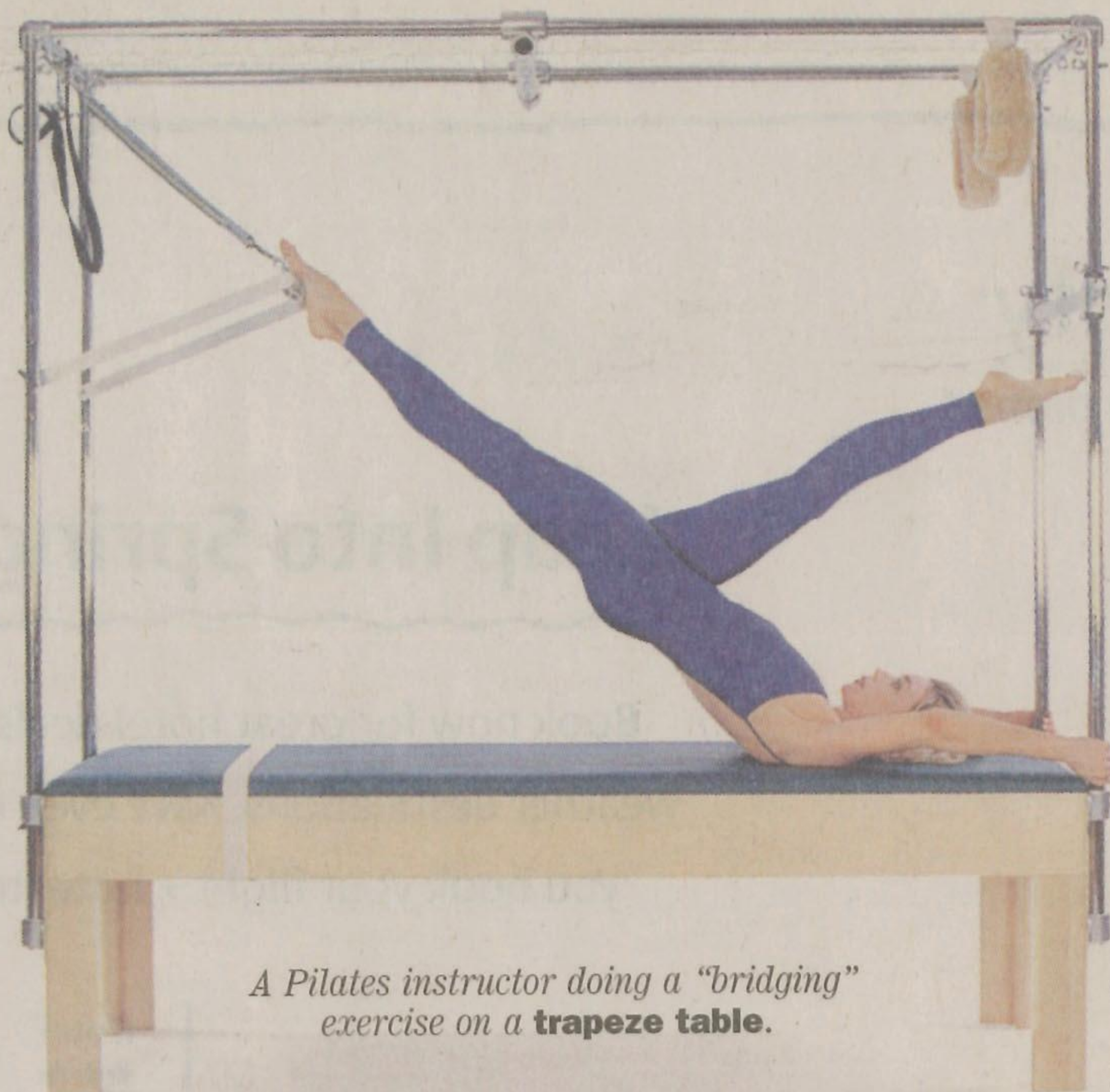
A Pilates instructor doing a "bridging" exercise on a trapeze table.

Fueled in part by a reputation for easing lower